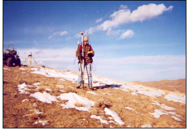
COAL BED METHANE WELL LOCATION Johnson County, Wyoming

Energy development is an essential part of the economy of Wyoming and neighboring states. Nelson Engineering has been providing services in the energy development field throughout this region for over 30 years. Our experience and expertise serve our clients well and are more necessary than ever given the growing and changing regulatory requirements of the Bureau of Land Management (BLM) and other state and federal agencies.