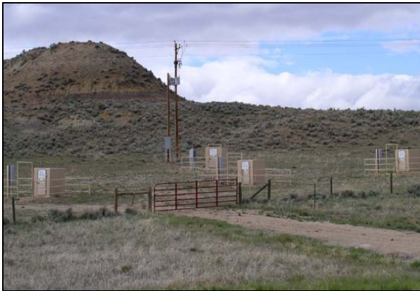
Methane Wells Powder River Basin, Wyoming

Our approach is to work closely with our clients and the regulatory agencies to ensure an on-time, cost-effective, and successful project. In conducting our work, we utilize the latest in design, surveying, and GIS equipment and software.