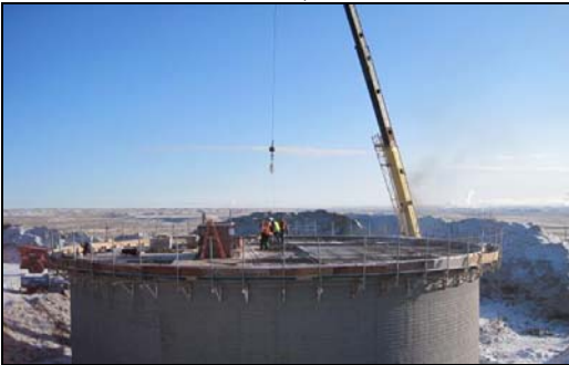
WATER STORAGE TANK Granger, WY