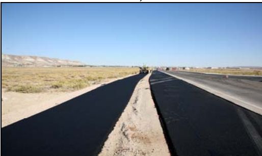
PATHWAY AND ROAD RESURFACING Rock Springs, WY

The quality, quantity, and durability of built infrastructure or public works is the hallmark of great civilizations. Still extant roads, viaducts, and stadiums the Romans built 2000 years ago speak to the enduring greatness of their society. The Great Wall of China and the Pyramids of Giza still cause us to consider how remarkable the societies were that produced such iconic works of collective endeavor.