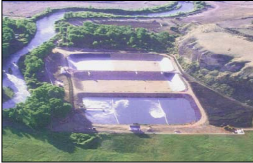
WASTEWATER TREATMENT LAGOON Dubois, WY